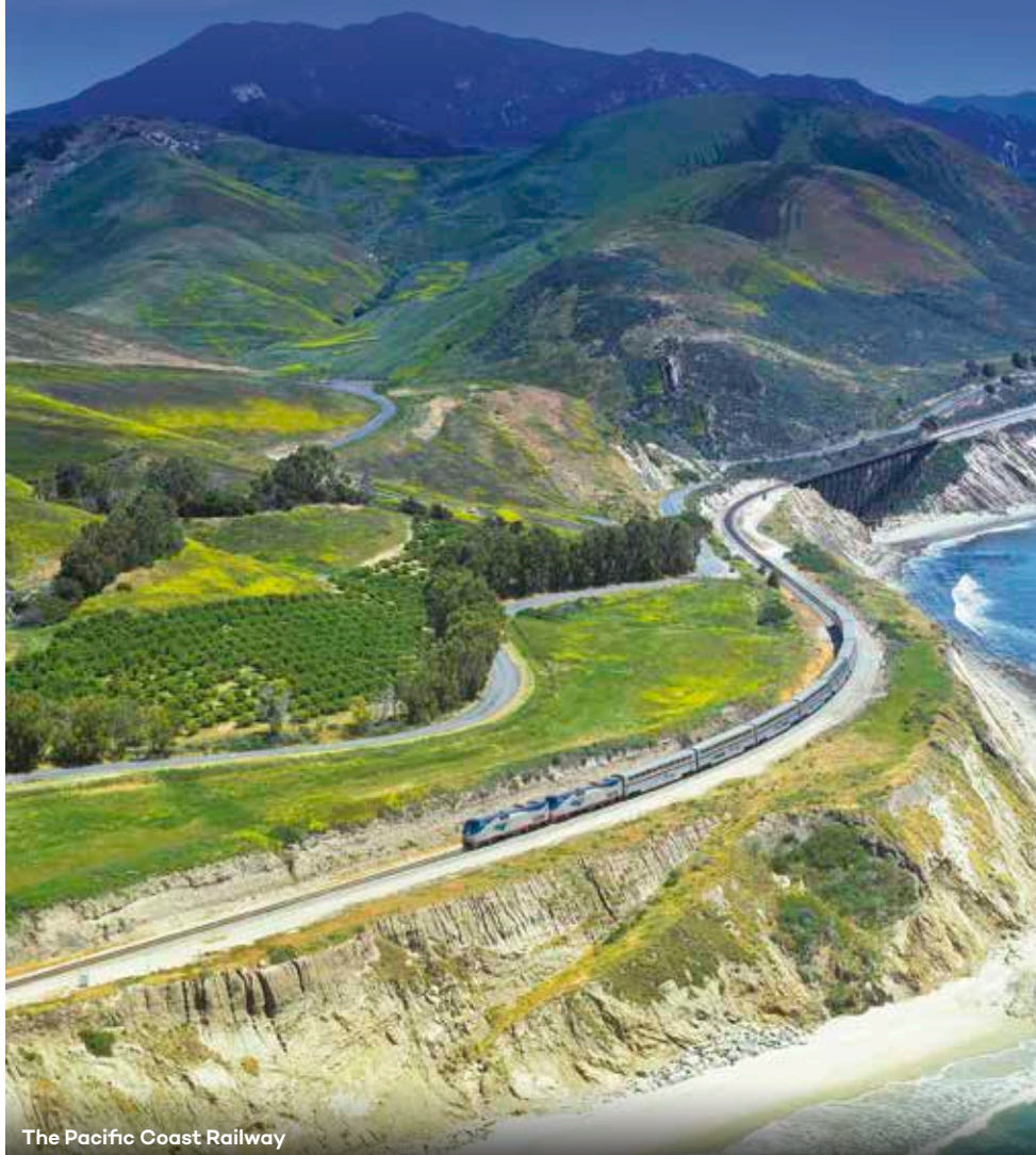
The Pacific Coast Railway

California is well-known for its Mediterranean-like climate and varied landscapes. This all-encompassing west coast tour takes you through the Napa Valley wine region, to beautiful Lake Tahoe, and across the rugged Sierra Nevada mountain range. Explore a trio of coastal cities – San Diego, San Francisco and Los Angeles, with sightseeing tours included, and take a scenic train journey along the Pacific coast. As you travel, experience the must-visit destinations of Yosemite Valley, Palm Springs, and Joshua Tree National Park, plus spend two nights on the iconic Las Vegas Strip. Optional excursions offer the chance to see Hoover Dam, tour the West Rim of the iconic Grand Canyon and explore the forests of Yosemite National Park. Staying in a selection of well-appointed 3- and 4-star hotels, you'll also benefit from an included full American breakfast each day.